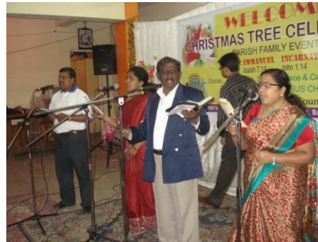
Praise Jesus Ministries in our church

Whereas now the Church of St.Peter, Rsuambagh is getting through with new Church building on the present structure, it will have a new vigour and spirit in few months time.