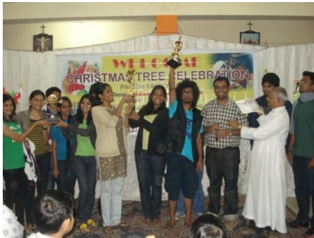
English Choir in their high spirit

While the English Choir who won many trophies in the archdiocesan range for their excellent participation and performance, sang so beautifully the Christmas carols