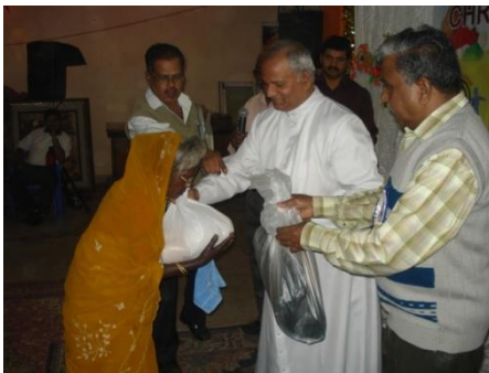
St.V.de.Paul Charity by the PP sojourner